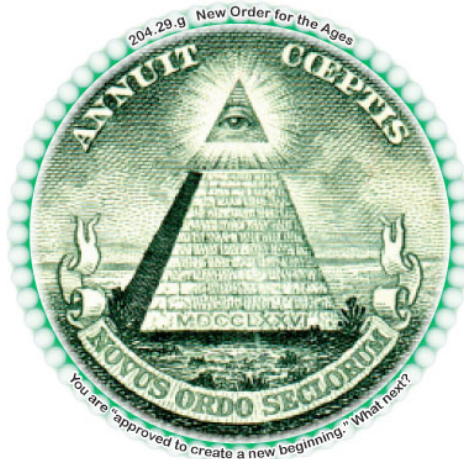
Image: A symbol, photo, graphic, or color contained within a color-coded Lifecircle™ suit frame. On the top of the Lifecircle™ is a web code and card Title. At the bottom is the Game Task.

Web Code: [Example: 204.29.g] Every printed Game card has a sister online Lifecircle™ web page that delivers deeper levels of content that has been stored in the “Living Web of Life” database for interactive GAME Play.